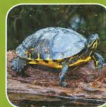
Yellow Bellied Slider