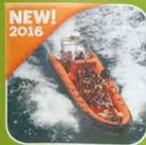
NEW! 2016 Boat Trips